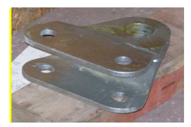
Part A, The hitch-couple