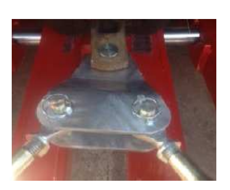
The hitch-couple, (Part A) attaches to the tractor's tow-hitch.

The two toplinks (which are adjustable in length) connect between the hitch-couple, and the most appropriate spare opening in the support stands.